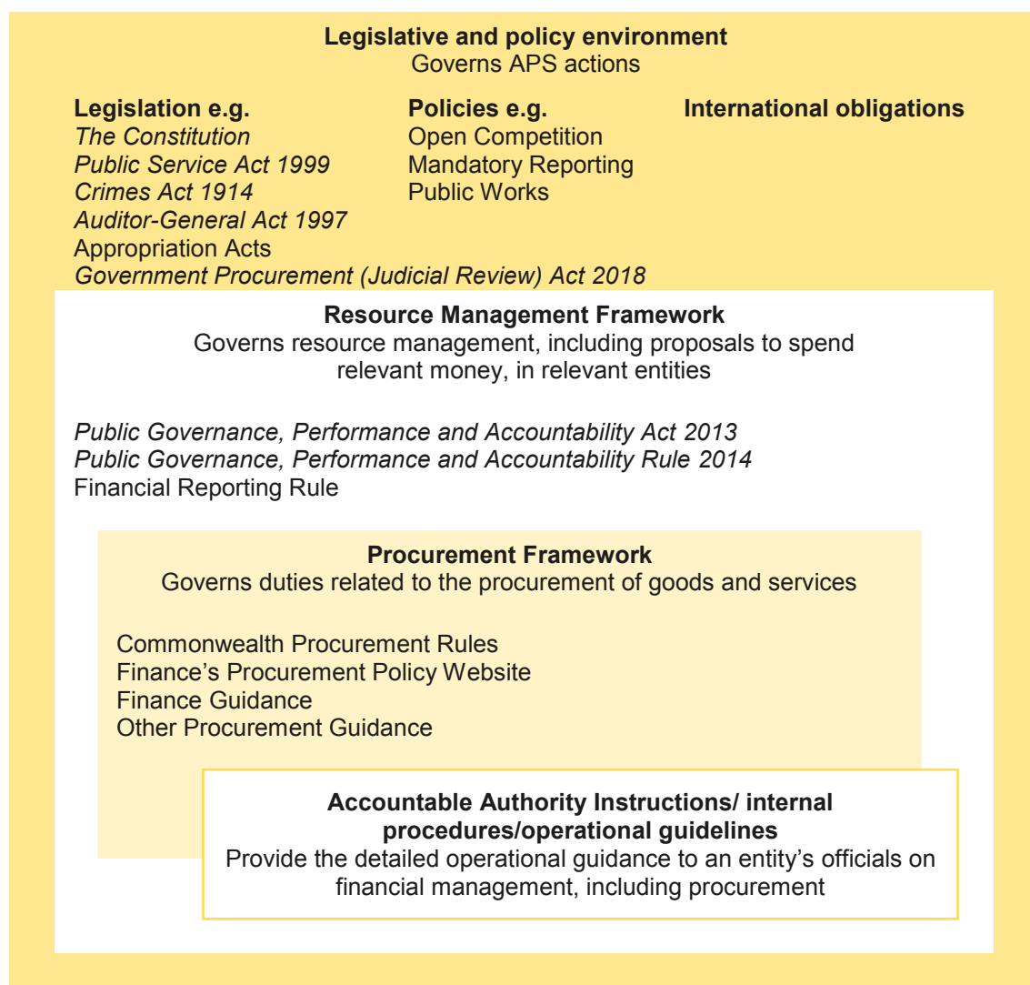
Figure 1: Legislation and policy