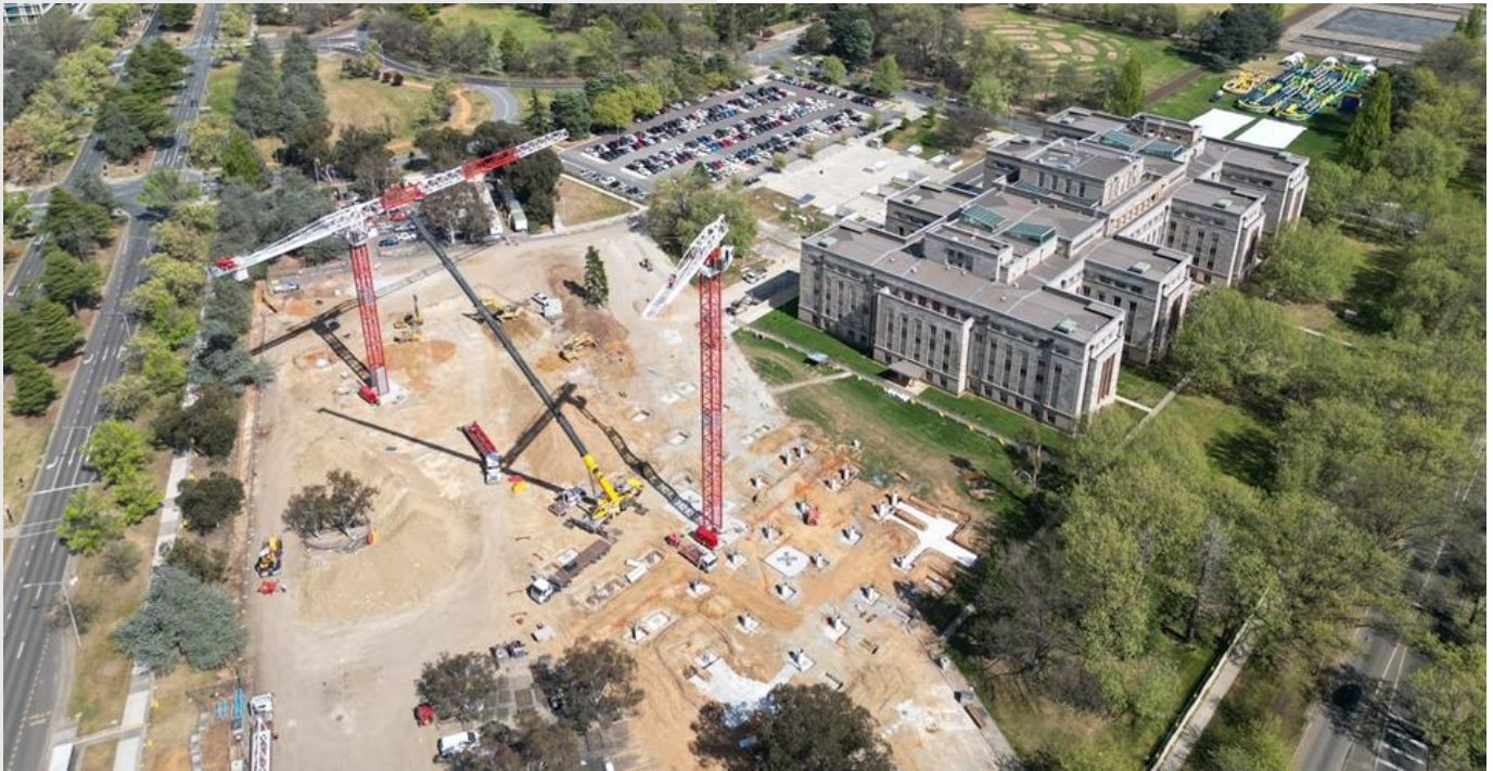
Site view of Tower Crane installation