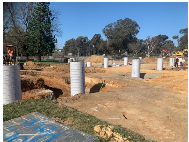
Car park construction site

Decommissioning of existing stormwater services to the building footprint is also occurring and the loop road works have commenced.