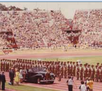
Queen Elizabeth arriving at the Commonwealth Games, Brisbane, 30.9.1982.