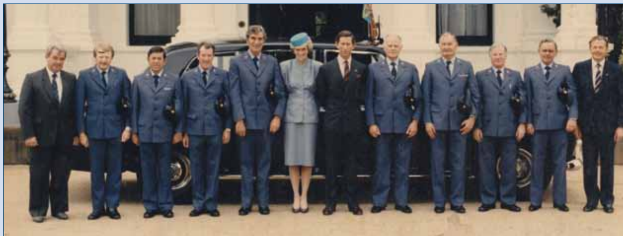
Princess Dianna and Prince Charles with drivers at Government House, Melbourne, 1983.