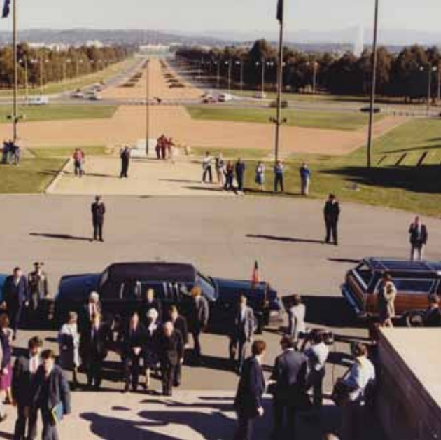
Visit of Vice-President George Bush to the Australian War Memorial, Canberra, 30.4.1982.