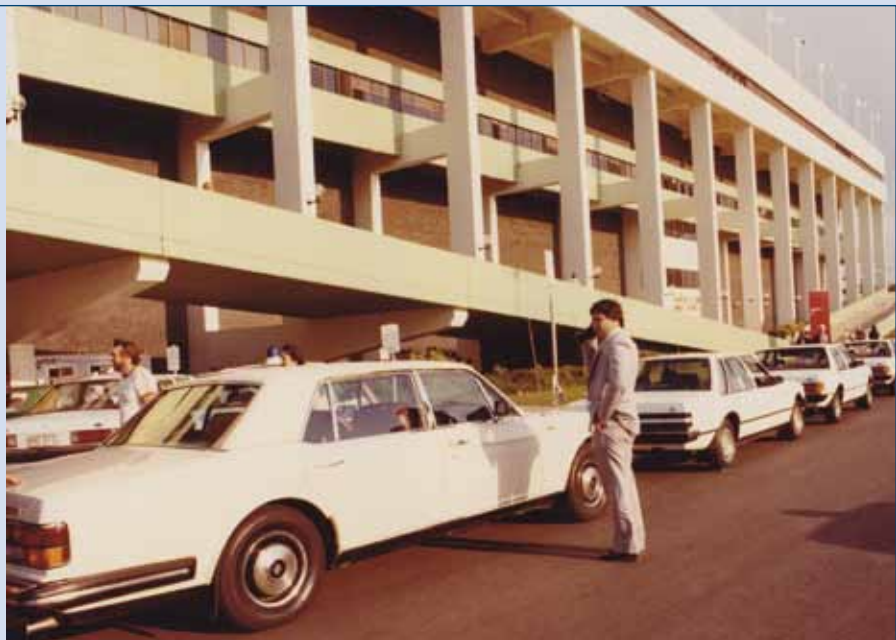
Part of the motorcade at QE II Stadium, Brisbane, at the time of the Commonwealth Games, 30.9.1982.