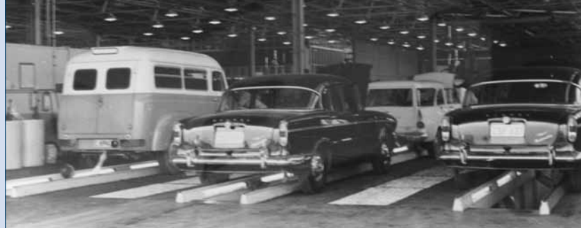
Commonwealth cars at Mascot airport, 6.3.1964.

The Duke of Edinburgh opened the games on behalf of Queen Elizabeth. He proved popular with drivers and, when travelling by himself, always insisted on being provided with a map so that he could follow his journey.