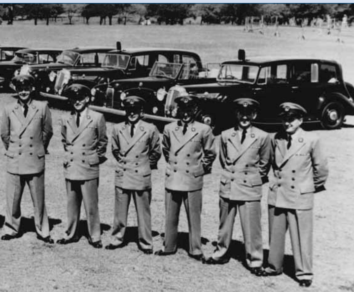
Royal Visit supervisor and drivers at Albert Park Barracks, 1959.

There was the need to cope with the sheer magnitude of the official party that was to arrive aboard a fleet of four aircraft. The President and immediate staff travelled on one aircraft; there were two aircraft for media and another for White House officials. A fifth aircraft, a massive Starlifter cargo plane, transported the President's armoured limousine and three other vehicles for his key staff. These had to be transported by Hercules C130 aircraft within Australia to Melbourne, Sydney and Brisbane.