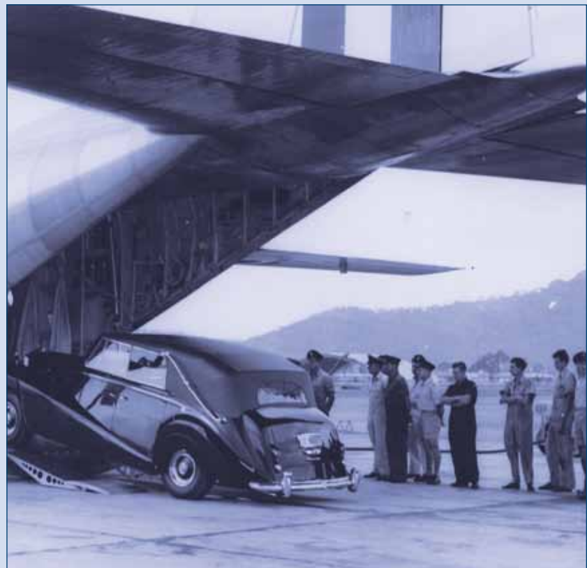
A Rolls Royce being unloaded from a Hercules aircraft at Townsville, 27.8.1959, during the Royal Visit of Princess Alexandra.

The drivers' uniform became an issue again in 1963 when that being worn in the states was no longer considered distinctive. By this time such uniforms – or virtually identical uniforms – were being worn by lift drivers and attendants employed by the Department of the Interior and drivers associated with other organisations. 7 The board endorsed the change to a single-breasted uniform of smoke-blue, similar to that worn by drivers during the Royal Visit that year.