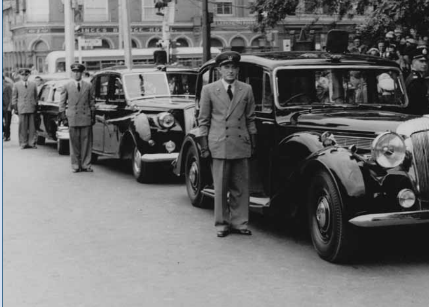
Cars and drivers outside St Paul's Cathedral, Melbourne.

The relocation caused something of a crisis within management and administration of the Department of Supply, with many senior officers comfortably settled in Melbourne and preferring to retire rather than move to Canberra. There was no appreciable effect on day-to-day operations of the car-with-driver operations within the capital or the states, but the relocation highlighted the anomaly of two virtually independent services. It was an issue to be resolved.