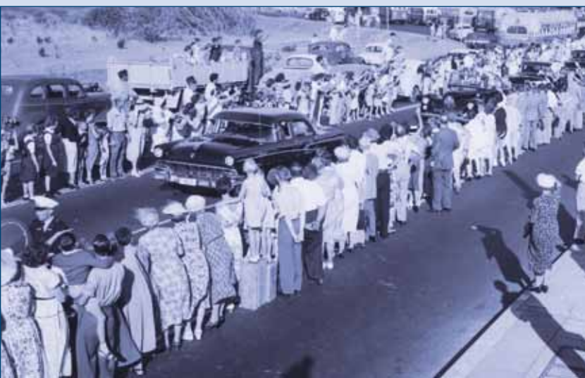
Motorcade, late 1950s, Western Australia.

The policy of the Central Transport Authority was to provide transport costs at rates that would recover costs and provide a small surplus. In 1966-67 the mean daily demand for jobs in Melbourne had risen to 900, sometimes peaking in excess of 1000 per day. 32