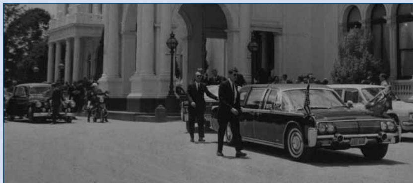
United States President Lyndon Johnson's motorcade at Government House, Melbourne, 1966.

He travelled to Melbourne on 21 October 1966 to be greeted by vast enthusiastic crowds – and protesters.