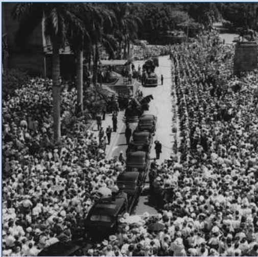
Royal Progress cars awaiting departure of Queen Elizabeth from the Brisbane Town Hall, King George Square, 1963.

Drivers who are wearing gloves and are about to be presented, on the command "gloves off", shall on the executive word of command, remove the right hand glove by grasping the fingers thereof and shall hold it flat in the left hand with the wrist and pointing forwards and shall then come to attention. 9