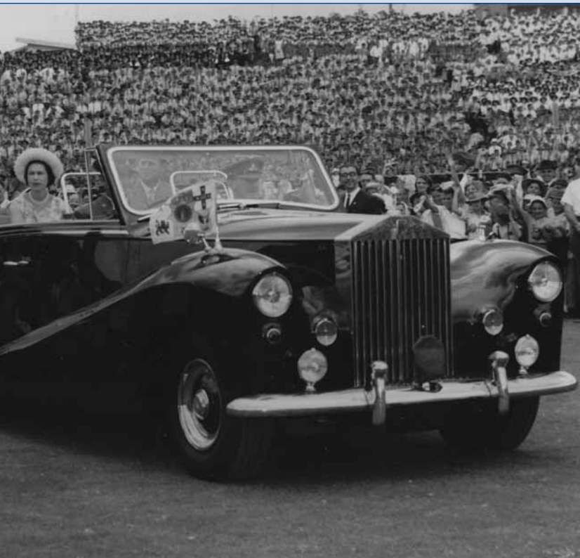
Arrival of Queen Elizabeth at the children's reception at the Brisbane Exhibition Grounds, 1963.

There was another innovation too, when the management board decided during financial year 1959-1960 that the light, medium and heavy fleets should be self-supporting, rather than cross-subsidise one another. The board also decided that Ford Customlines were to be replaced after 112,000 miles and after three years; Holden vehicles after 80,000 miles.