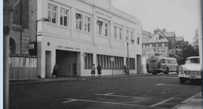
Light Transport Depot, 50 Murray Street, Perth, 1960.