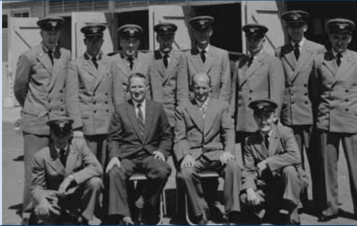
Brisbane staff and drivers, c1959.

The Commonwealth car-with-driver services in the states and the Australian Capital Territory had become firmly established by the 1950s. The services expanded considerably during the economically buoyant and optimistic years that followed with few limits put on their size and composition. The new demands made of the services – particularly provision of transport for guests of government – also reflected the changing political relationship of Australia to its immediate region and the world at large.