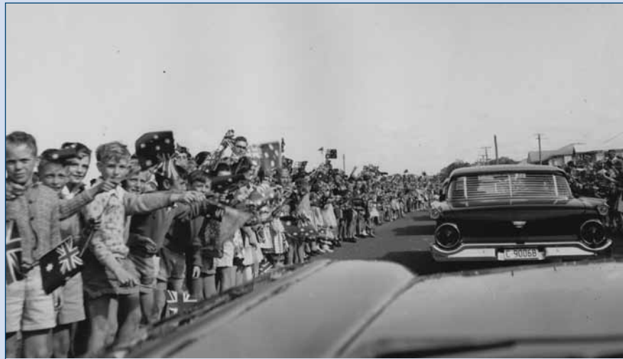
Passenger's view of the Royal Progress, 1963.