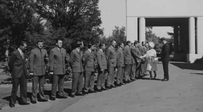
The Queen Mother, Queen Elizabeth, greeting drivers at Government House, Melbourne, 1966.